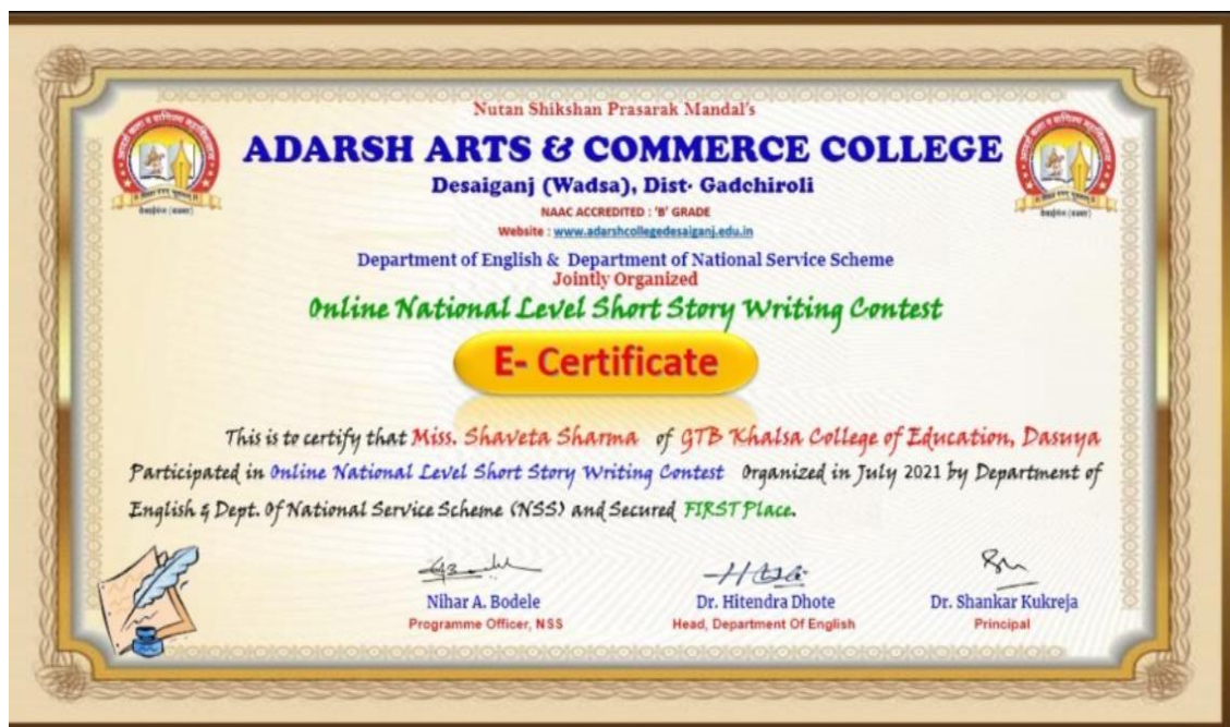
Certificate given to the second winner in National Level Short Story Wring Competition : July 2021