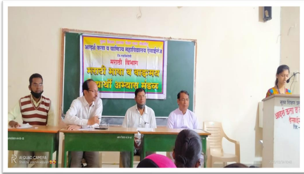
Photograph of singing competition:11.2.2020