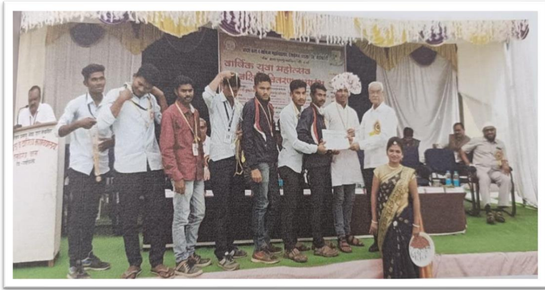
Felicitations of Kabaddi champions : 1.10.2017