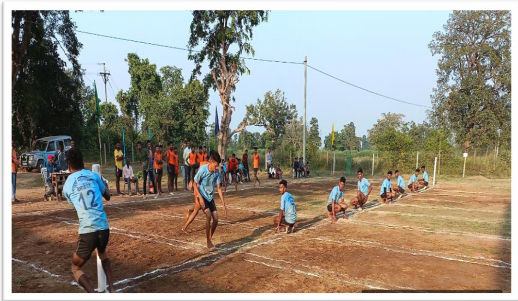
Photograph of Kho-Kho Competition: 14.10.2019