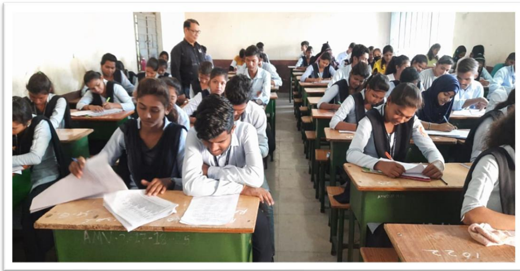
Photograph of essay writing competition: 17.7.2017

5.Essay writing Competition: To develop the writing skill among the students the department of cultural and Literary activities, NSS Department and Women empowerment cell jointly organized Essay Writing Competition on 17.7.2017. Many participants from different classes participated in this competition.