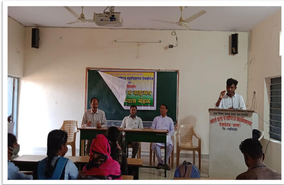
Photograph of Singing Competition : 22.4.2022