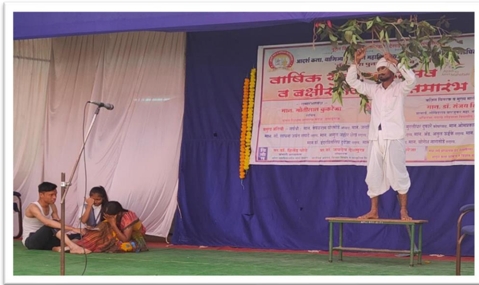
Photograph of One Act Play Competition: 29.4.2022

8. Singing Competition : To encourage the students to give a stage performance and to develop singing skill among them the department of cultural and Literary activities and NSS Department jointly organized Singing Competition on 29.4.2022. Many students from all the three streams participated in this competition.