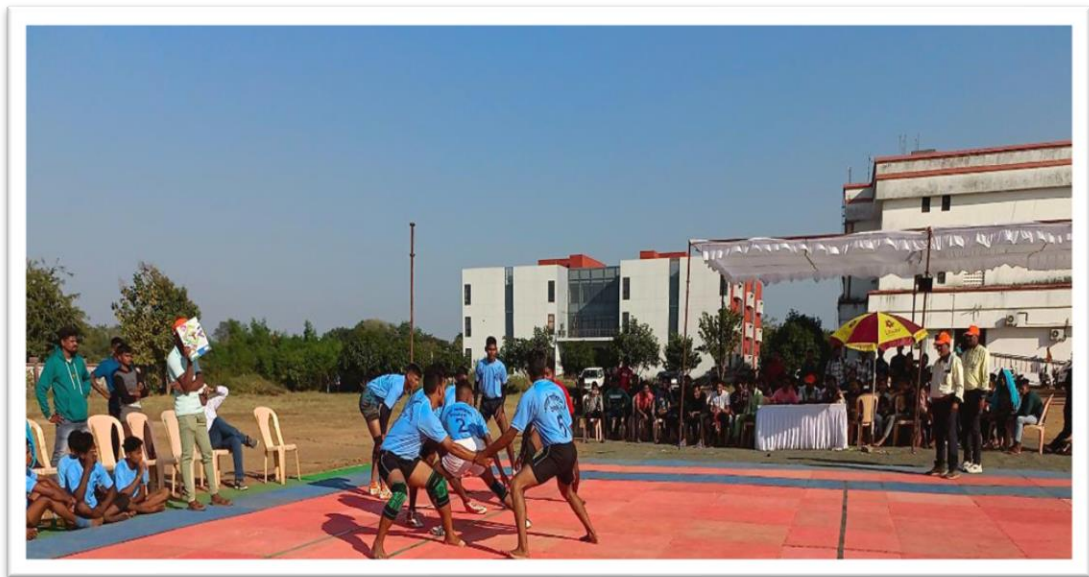
Photograph Kabaddi (Men) competition: 13.12.2021