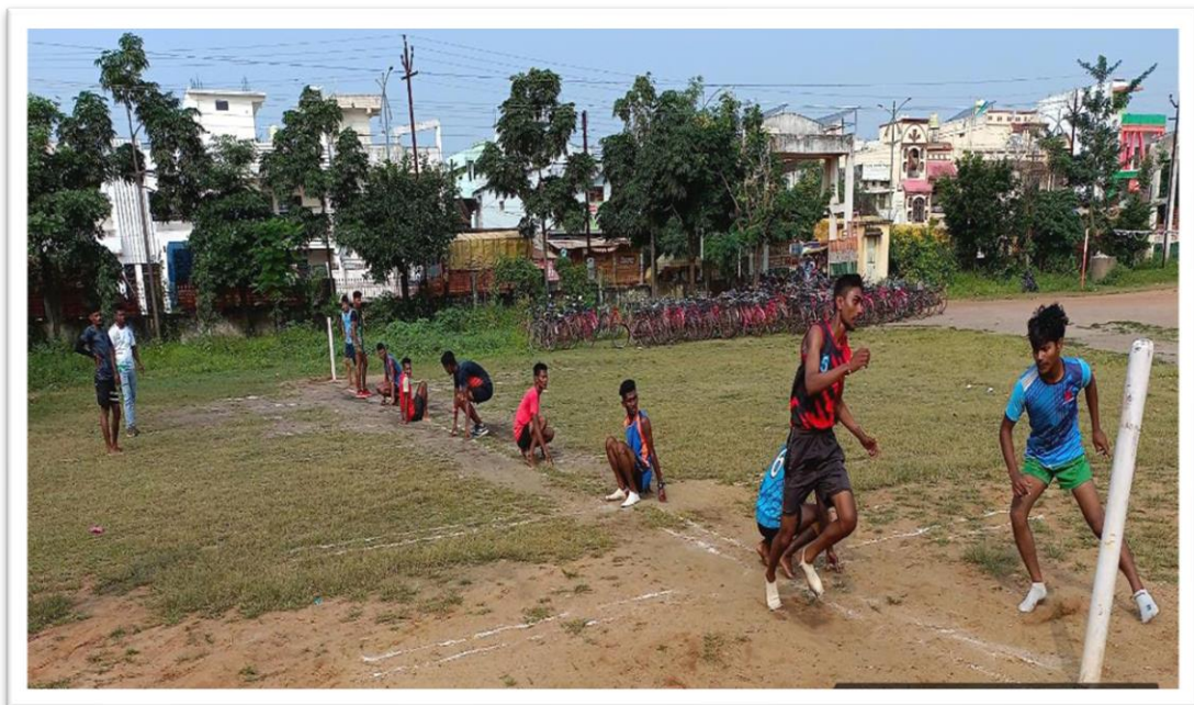
Photograph of Kho-Kho Competition: 4.10.2018

5. Kho-Kho : On 4.10.2018 the department organized interclass Kho-Kho (Men) competition. The class-wise teams were formed and the teams played as per the lots. The first and second winning teams and the best players were felicitated with medals at Annual Prize Distribution ceremony.