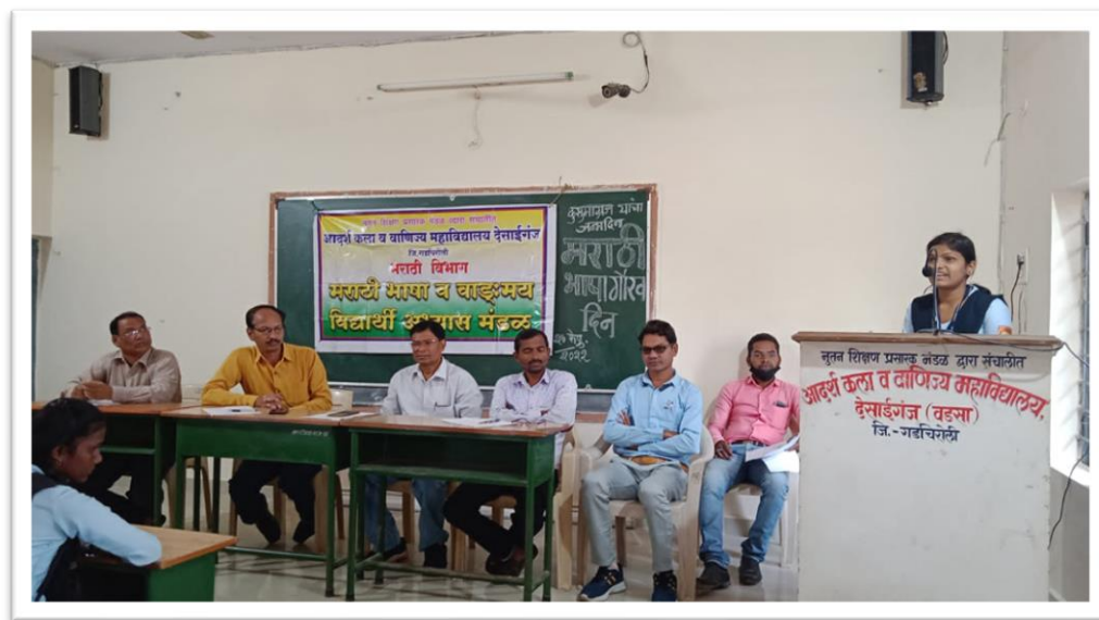
One of the participant expressing her view on the topic of speech competition: 27.2.2019

3. Speech Competition : To encourage the students to give a stage performance and to develop oratorical skill among them Marathi Language and Literature Students' Study Council and NSS Department jointly organized speech Competition on 27.2.2019. Many students from all the three streams participated in this competition.