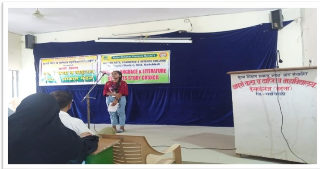
Photograph of the Speech Competition : 28.4.2022