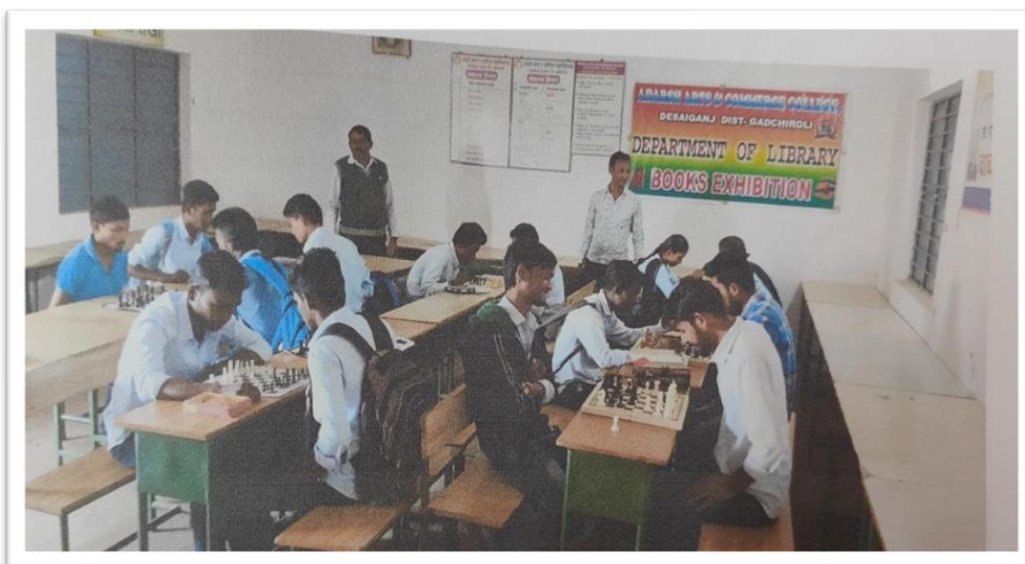
Photograph of Chess Competition: 26.9.2017