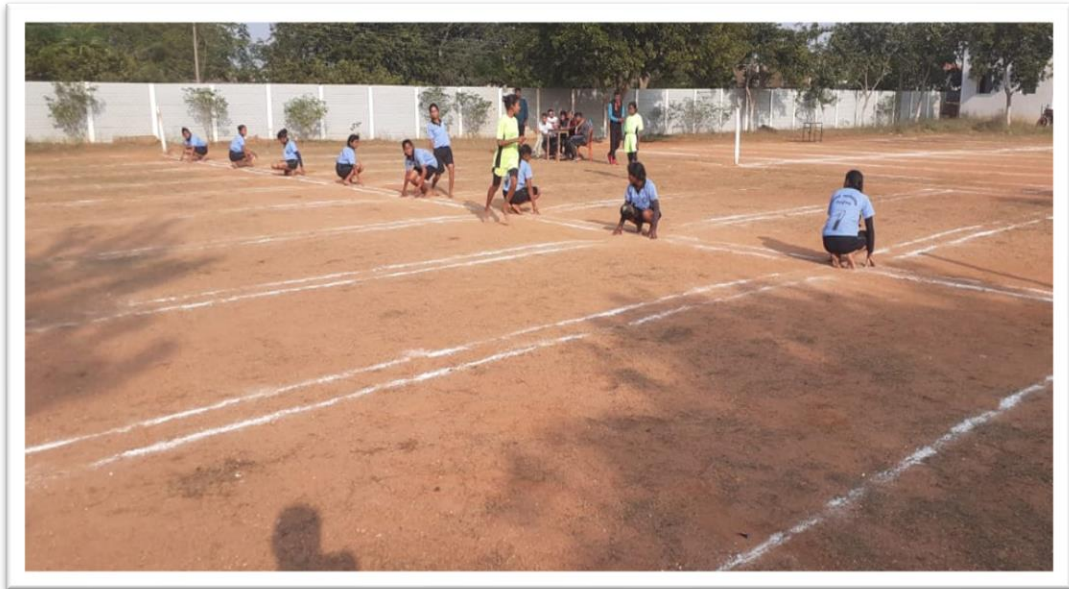
Photograph of Kho-Kho Competition : 14.10.2019