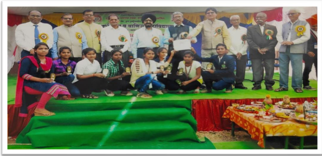
Kabaddi champions (Women) being honoured with trophies :14.12.2021