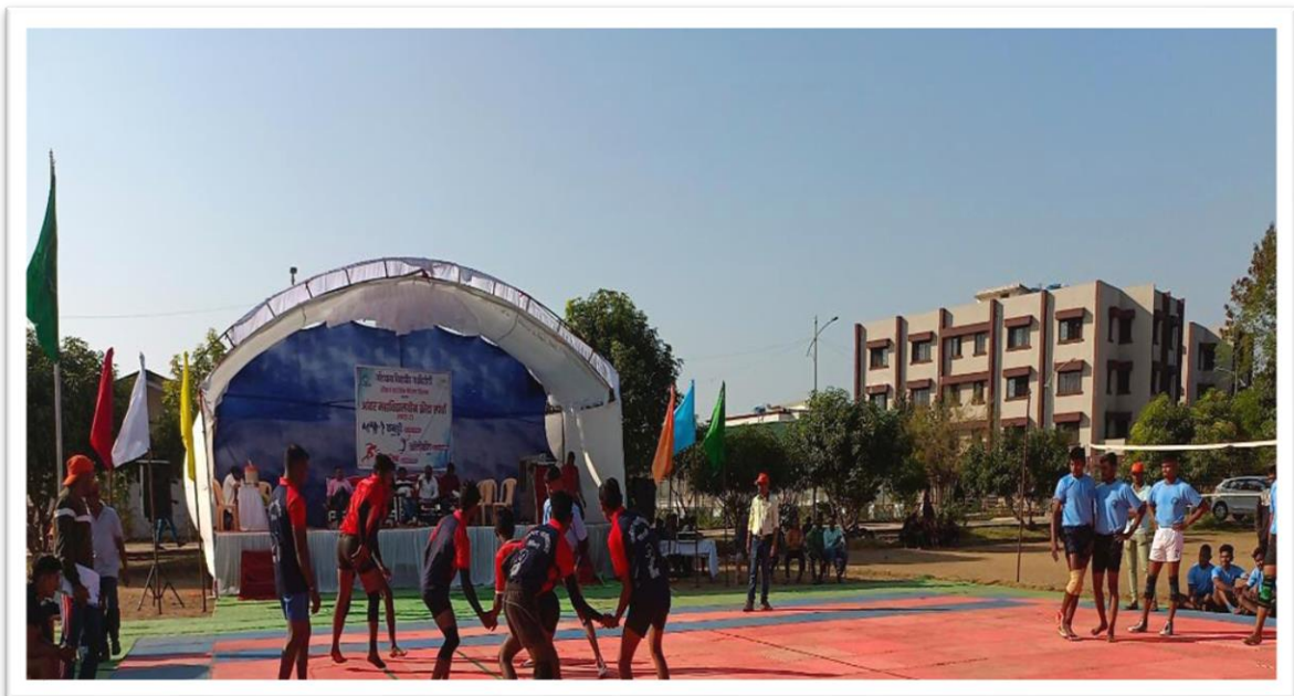
Photograph of Kabaddi Competition:10.10.2019