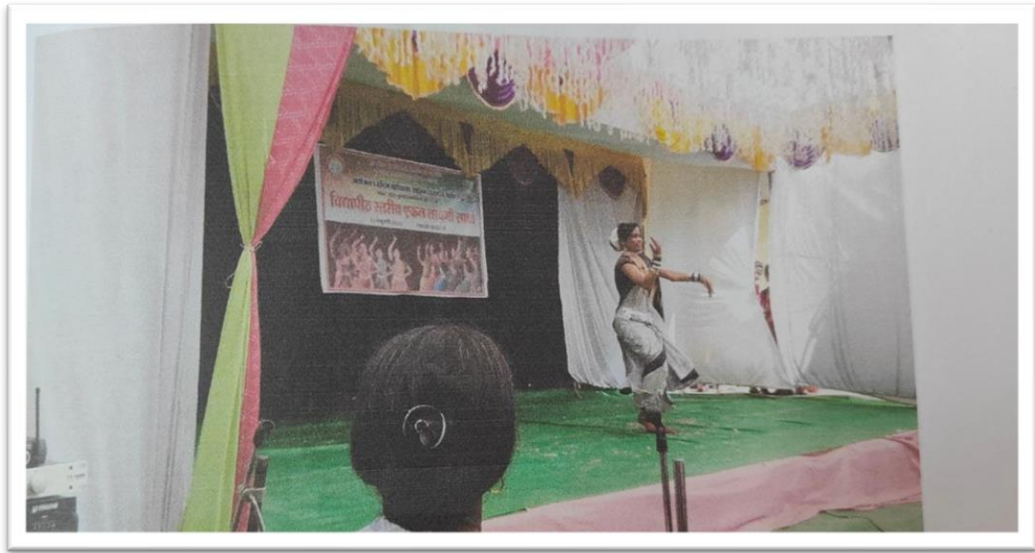
Photograph of Uni. Level dance Competition : 31.1.2018

3. Rangoli Competition : The department of cultural and Literary activities and NSS department jointly organized Rangoli Competition on 4.2.2018. Many girls from all the three streams participated in this competition.