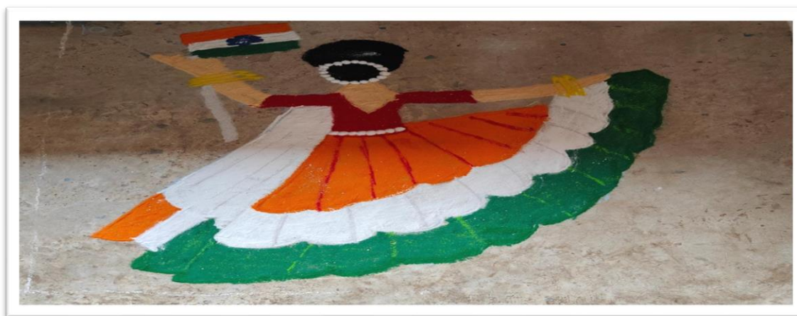
Photograph of Rangoli Competition : 30.4.2022