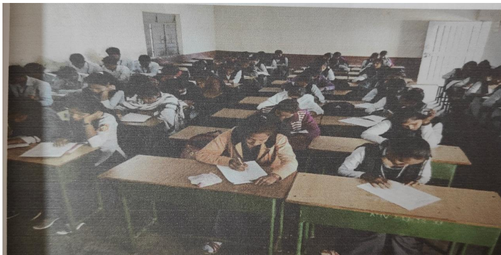
Photograph of essay writing competition: 5.9.2020

To develop the writing skill among the students the department of cultural and Literary activities, NSS Department and Women empowerment cell jointly organized Essay Writing Competition on 5.9.2020. Many participants from different classes participated in this competition.