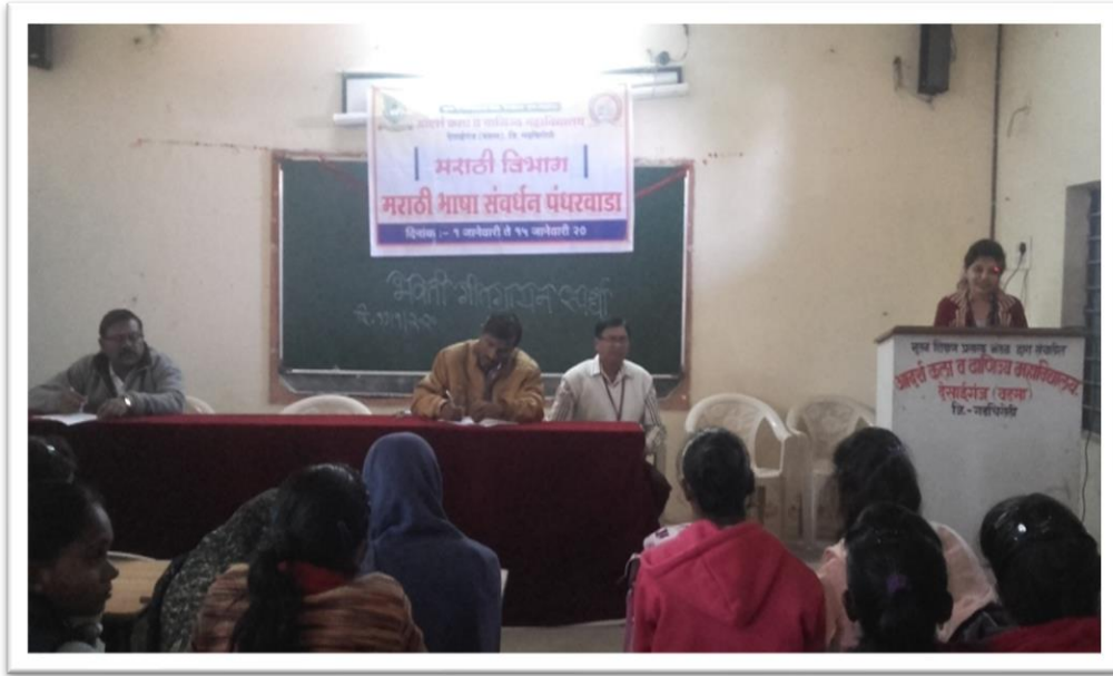
Photograph of the singing competition: 11.1.2020