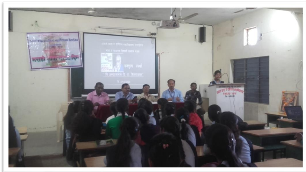
Photograph of speech competition: 27.2.2020

To encourage the students to give a stage performance and to develop oratorical skill among them Marathi Language and Literature Students' Study Council and NSS Department jointly organized speech Competition on 27.2.2020. Many students from all the three streams participated in this competition.