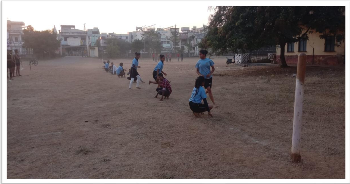
Photograph of Kho-Kho Competition:4.10.2018

4. Kho-Kho : On 4.10.2018 the department organized interclass Kho-Kho (Women) competition. The class-wise teams were formed and the teams played as per the lots. The first and second winning teams and the best players were felicitated with medals at Annual Prize Distribution ceremony.