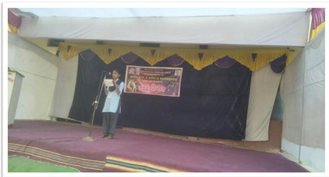
Photograph of the event: 14.2.2019

3. Speech Competition : To encourage the students to give a stage performance and to develop oratorical skill among them Marathi Language and Literature Students' Study Council and NSS Department jointly organized speech Competition on 27.2.2019. Many students from all the three streams participated in this competition.