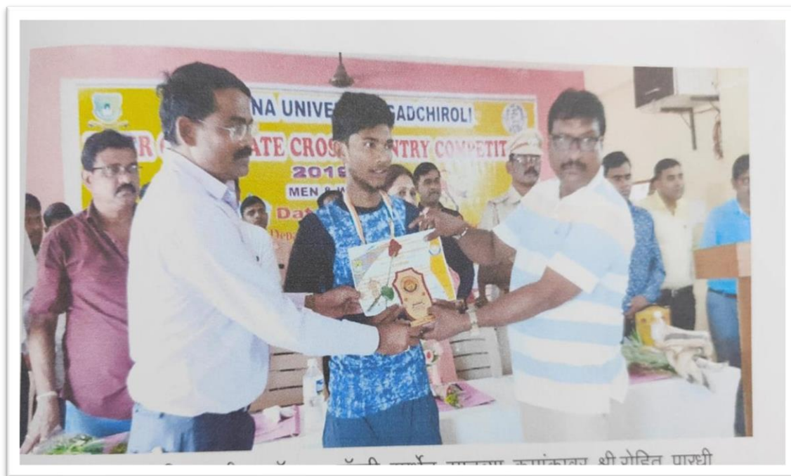
One of our champion accepting the prize in Cross-country competition: 20.8.2019