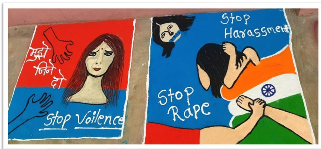
Photograph of Rangoli Competition : 4.2.2018

3. Rangoli Competition : The department of cultural and Literary activities and NSS department jointly organized Rangoli Competition on 4.2.2018. Many girls from all the three streams participated in this competition.