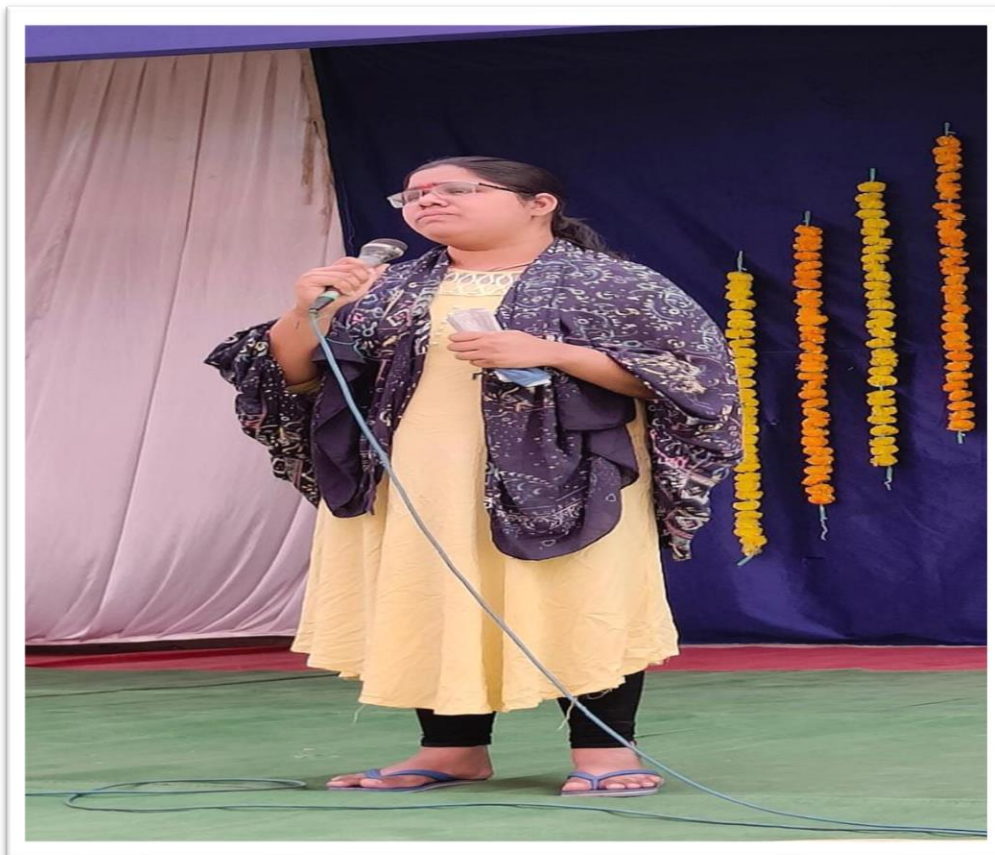
Photograph of Singing Competition : 29.4.2022

8. Singing Competition : To encourage the students to give a stage performance and to develop singing skill among them the department of cultural and Literary activities and NSS Department jointly organized Singing Competition on 29.4.2022. Many students from all the three streams participated in this competition.