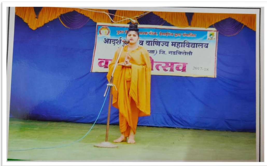
Photograph of Fancy Dress Competition: 2.2.2018

1.Fancy Dress Competition : To encourage the students to study different cultures, to make them ready for stage performance the department of cultural and Literary activities and Women Empowerment Cell jointly organized Fancy Dress Competition on 2.2.2018. Many girls from all the three streams participated in this competition spontaneously.