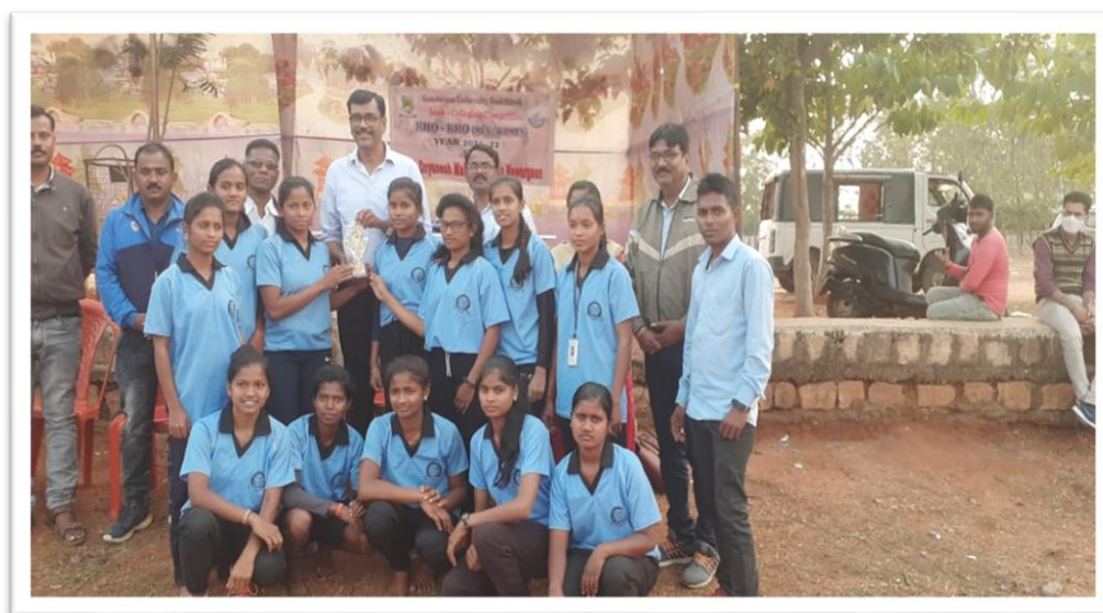
Photograph of Kho-Kho winning team (Women): 25.12.2021