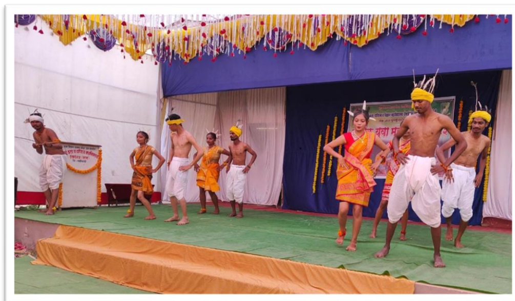
Group of students performing a group dance : 29.4.2022