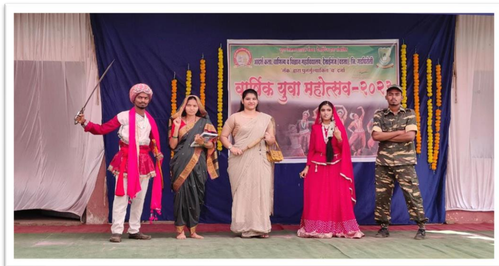
Photograph of Fancy Dress Competition:29.4.2022