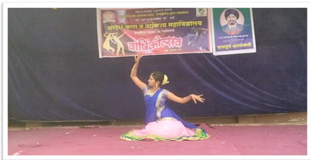
Photograph of Solo Dance Competition: 14.2.2019