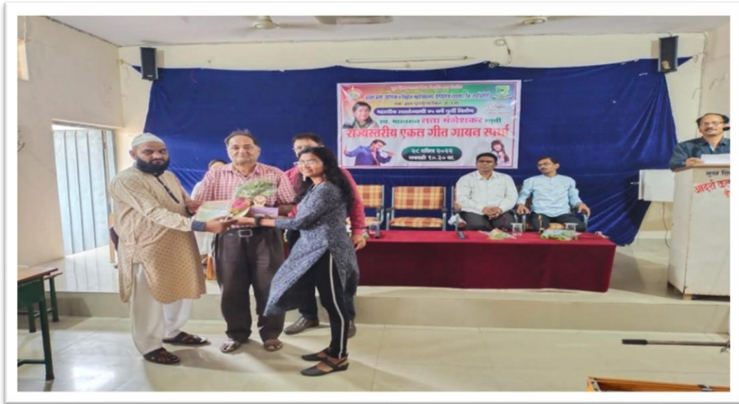
The first winner in state level Late Lata Mangeshkar solo singing Competition accepting the prize