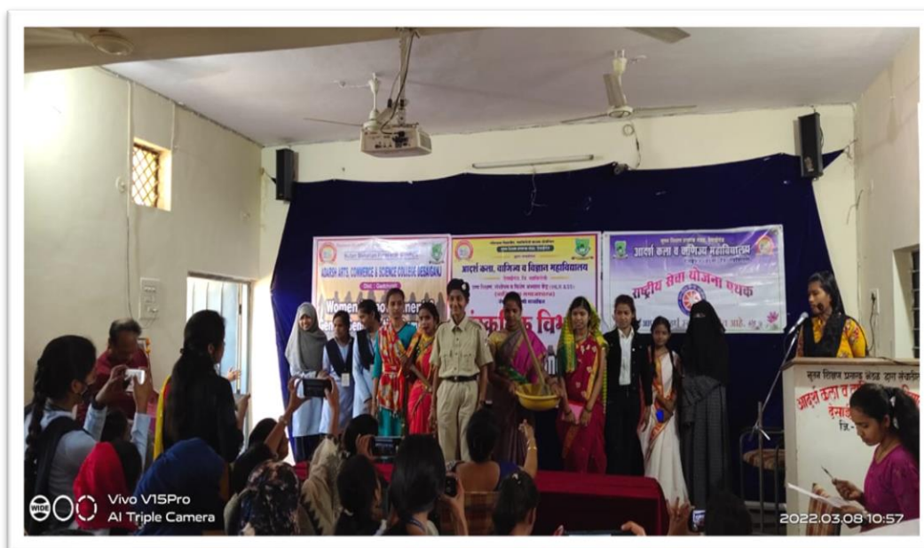
Photograph of Fancy Dress Competition :8.3.2022