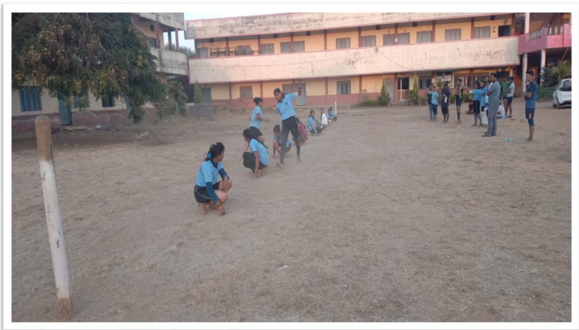
Photograph of Kho-Kho Competition :29.9.2017