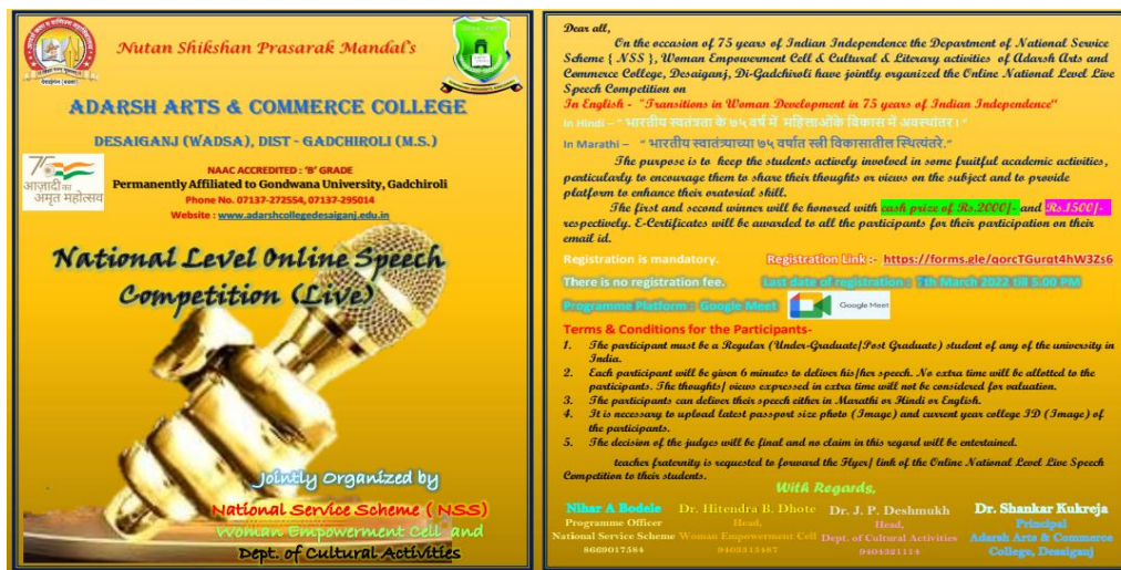
Brochure of National Level Speech Competition : 8.3.2022