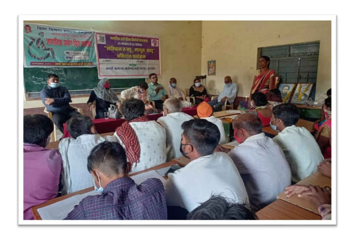
Monthly Gathering of Disha Divyang Sangathana Members, held on 3^{\rm rd} day of every month organized at the college.