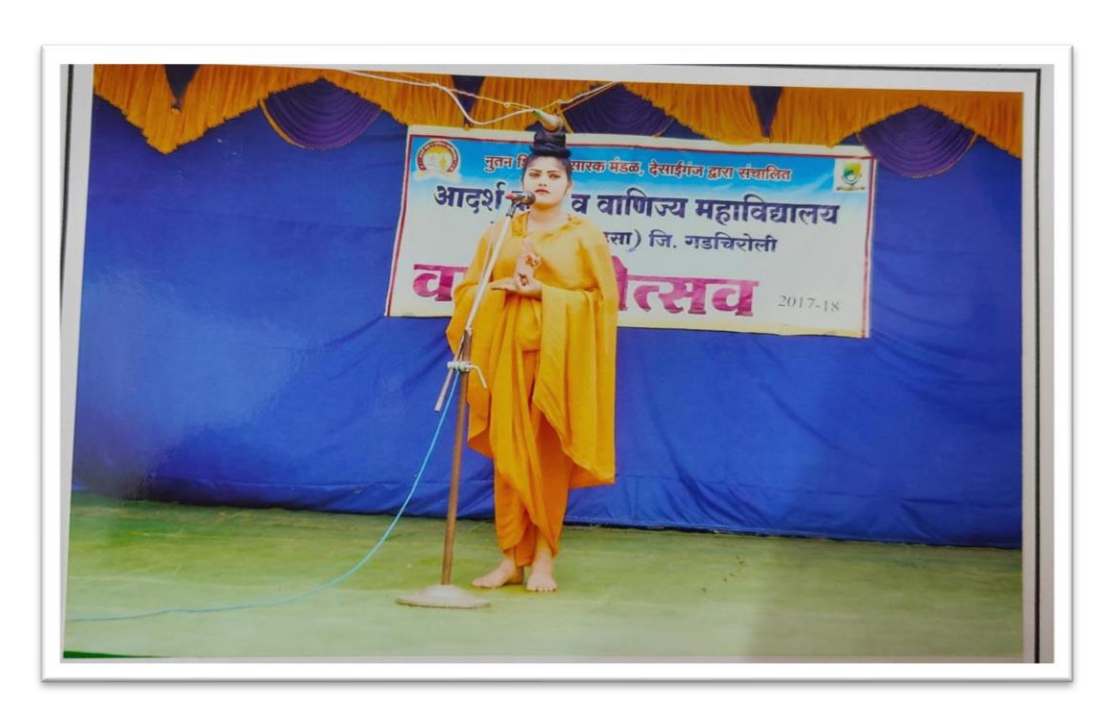
Photograph of Fancy Dress Competition: 2.2.2018

1.Fancy Dress Competition : To encourage the students to study different cultures, to make them ready for stage performance the department of cultural and Literary activities and Women Empowerment Cell jointly organized Fancy Dress Competition on 2.2.2018. Many girls from all the three streams participated in this competition spontaneously.