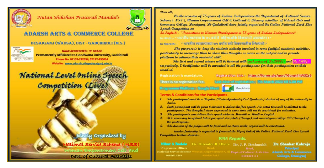
Brochure of National Level Speech Competition: 8.3.2022