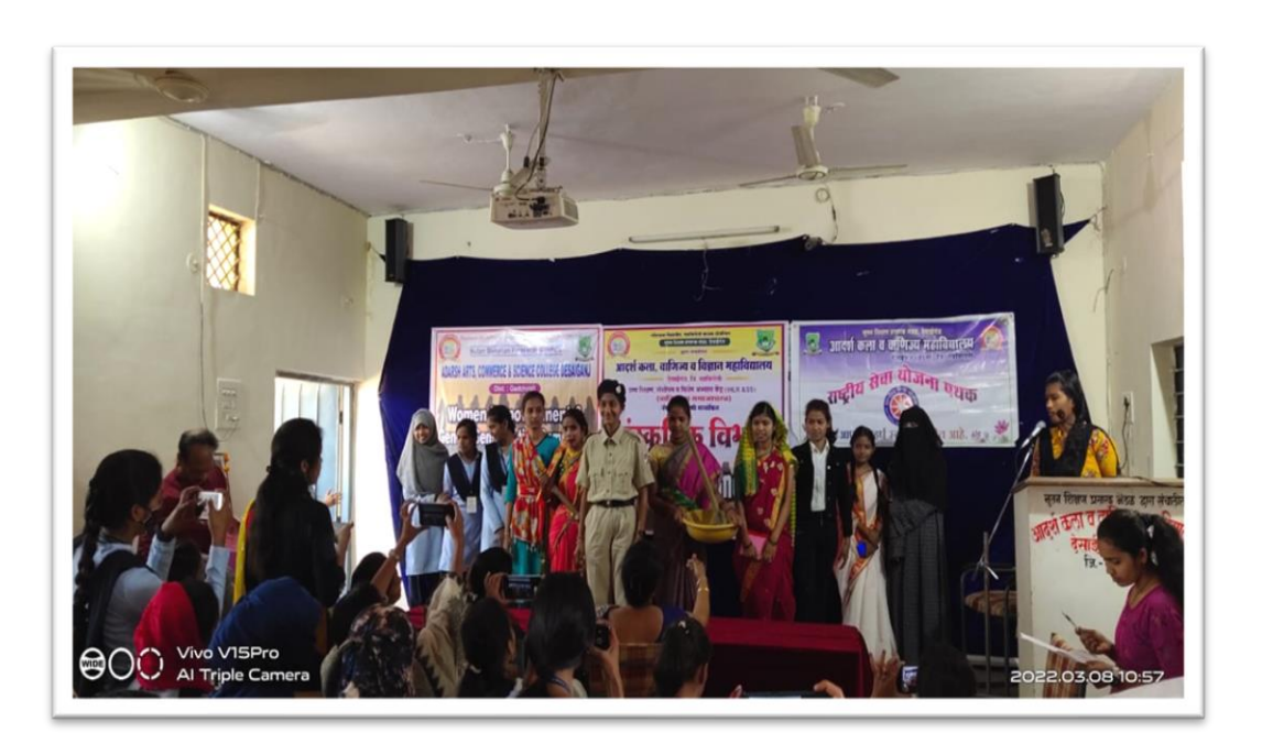
Photograph of Fancy Dress Competition: 8.3.2022

1. Fancy Dress Competition: The department of cultural and Literary activities and Women empowerment cell jointly organized Fancy Dress Competition on 8.3.2022. Many girls from all the three streams participated in this competition.