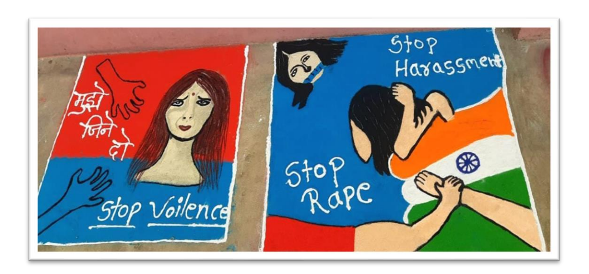
Photograph of Rangoli Competition: 4.2.2018

3. Rangoli Competition: The department of cultural and Literary activities and NSS department jointly organized Rangoli Competition on 4.2.2018. Many girls from all the three streams participated in this competition.