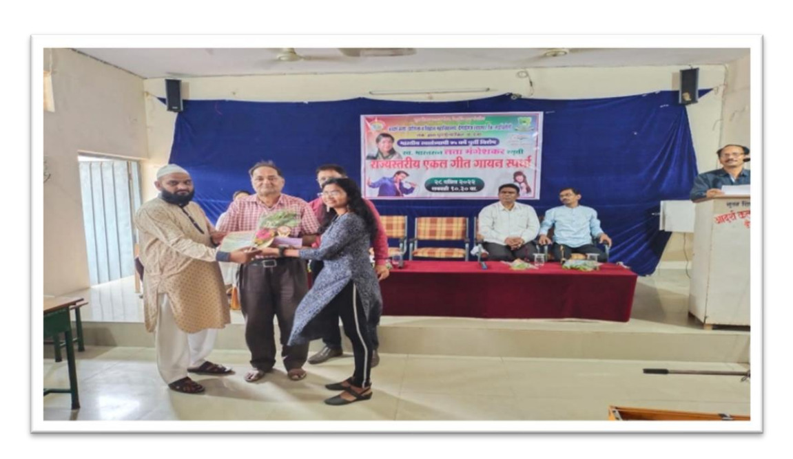
The first winner in state level Late Lata Mangeshkar solo singing Competition accepting the prize

6. Fancy Dress Competition : The department of cultural and Literary activities and NSS Department jointly organized Fancy Dress Competition on 29.4.2022. Many students from all the three streams participated in this competition.