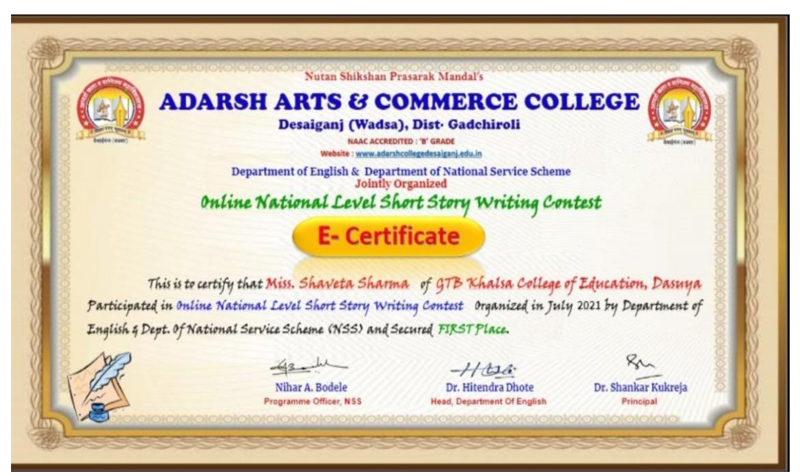
Certificate given to the second winner in National Level Short Story Wring Competition: July 2021